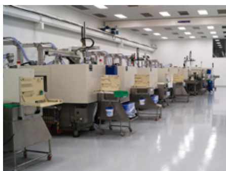
Clean room production according to ISO 14644, class 7

RAUMEDIC, development partner and system supplier of polymer-based components and systems for the medical and pharmaceutical industry is opening its new headquarters in Mills River, North Carolina. A modern, full-service development and production center allows RAUMEDIC to provide its customers in North America high-quality polymer extrusion, injection molding and assembled products on site.