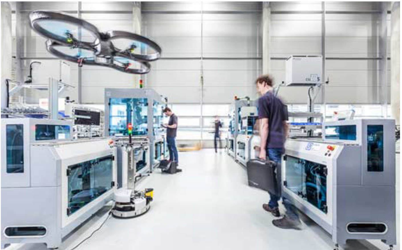
Selected parts of the test environment for industrial research, which is normally located at the Application Center Industrie 4.0 in Stuttgart, will be on show at AUTOMATICA.

At the Fraunhofer IPA booth, the four cornerstones of Industrie 4.0 can be experienced in various ways within the overall context of a digital production: a wide range of cyberphysical systems, a participatory platform, the Internet of things and services, and also a portal with intuitive man-machine interfaces for interacting with the manufacturing system. With the aid of exhibits interacting intelligently with the cloud, visitors can comprehend the solutions offered by the research institute for various segments of the value chain. These range from singularization, though (partially-)automated assembly processes and workpiece transportation, right up to networking components with the IT infrastructure. The services are not only relevant to users and decision-makers in manufacturing enterprises but also to their suppliers: for planning, operating and optimizing produc-