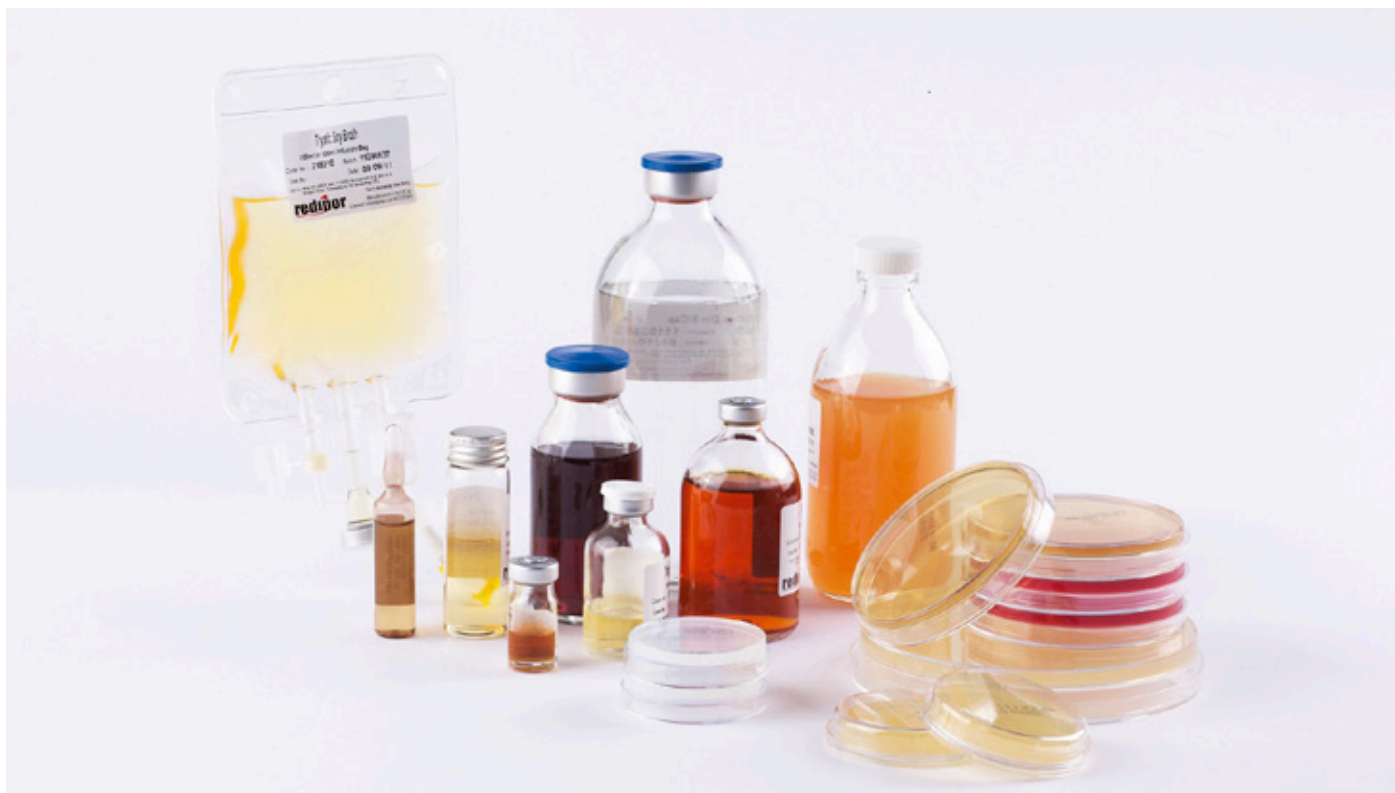
The Redipor® prepared microbiological media range is available in a wide variety of formats

Cherwell Laboratories, specialists in cleanroom microbiology products, have introduced over 55 new products to their Redipor® prepared microbiological media range in the last twelve months. Cherwell's dedication to customer service and their ability to deliver bespoke prepared media solutions has seen the company working closely with customers to deliver these new prepared media products to meet their specific requirements.