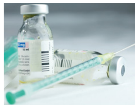
Key components of pharmaceutical production: While WFI is predominantly needed for the production of infusion and injection solutions, pure steam is mainly used for sterilizing equipment components.

With these new developments, Bosch has streamlined the product range, compiling a consistent set of machines. The number of different sizes was reduced from eleven to six pure steam generators and from fourteen to ten distillation units. "Customers profit from shorter delivery times, lower acquisition costs due to a higher degree of standardization and modularization," says Medina. The series now encompasses a performance range of 100 to 7,500