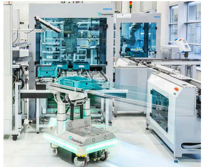
Automated guided vehicles can be located highly accurately with the aid of external sensors linked to the cloud.

vigating systems. Since both automated guided vehicles (AGVs), or multiple AGVs in an industrial context, supply their locally-acquired data to a central point, the entire fleet benefits from more accurate localization and more efficient pathplanning. The AGVs could then act as »lean clients«, i.e. because computer-intensive navigation algorithms could be outsourced to the cloud server, they would require less hardware but would still retain a high degree of navigation intelligence. External sensors, e.g. from the manufacturing environment, could be integrated, as well as navigation functions provided in the form of services.