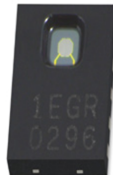
Digital humidity and temperature sensor from E+E Elektronik.

EEH110 and EE210 are optimized for mass manufacturing and can be processed automatically thanks to the DFN enclosure. The digital RH/T sensors are ideal for use in smart home applications, in air conditioning or in the field of consumer and entertainment technology.