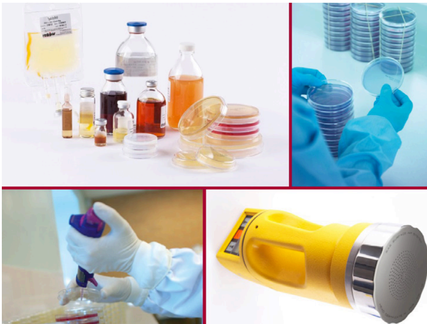
Cherwell's extensive product range for passive and active environmental monitoring.

Focus on Microbiological Contamination Control & Risk in Pharmaceuticals, Cosmetics & Toiletries