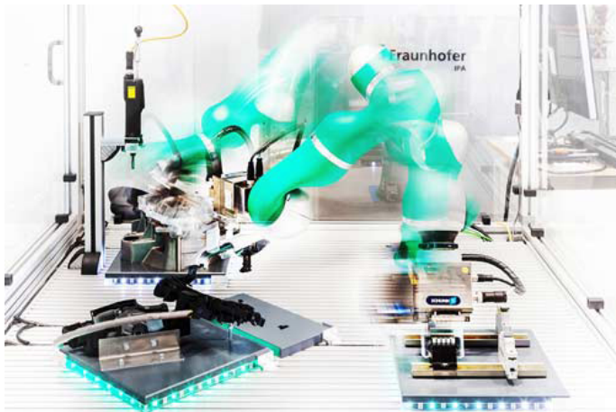
With a new software program, a wide range of forcecontrolled assembly processes can now be automated.

At the AUTOMATICA, »Virtual Fort Knox« plays a key role: various demonstrators are linked via the platform. As with a real production plant, a wide range of near real-time status and process data is collected in the system for direct processing. The huge advantage, in particular for small and medium-sized enterprises, is that users can access the information from applications via an output medium of their choice. This does away with the need to procure and maintain a suitable IT environment. Furthermore, the user is billed for the use of the software and hardware on a »pay-as-you-go« basis, thus avoiding fixed costs.