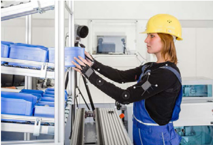
An ergonomic workplace analysis leads to concepts for relieving the burden on humans as they work.