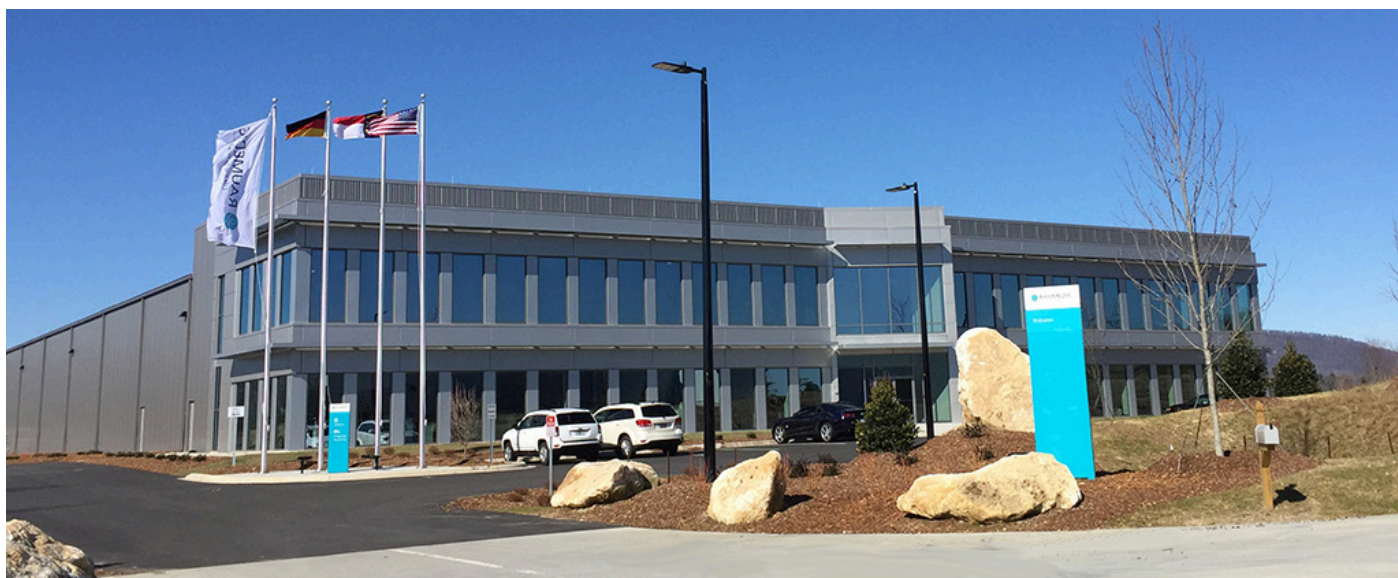
RAUMEDIC development center and production facility in Mills River, NC.