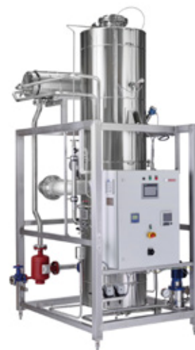
New generation of pure steam generators: The new, compact design of the evaporator contributes to optimal thermal use of heating energy, leading to high yields and low operating costs.

kilograms per hour. In order to enable quick set-up, feed water pumps with frequency regulation are used for all sizes. The equipment can be further adapted to the respective operating conditions.