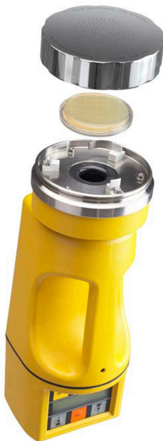
Cherwell has supplied & calibrated SAS microbial air samplers to the UK for over 30 years.

As part of its ongoing commitment to ensuring the highest quality service and fastest possible turnaround times, Cherwell has recently upgraded its facility with